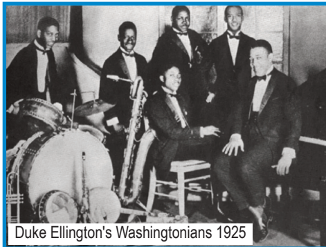
Duke Ellington's Washingtonians 1925