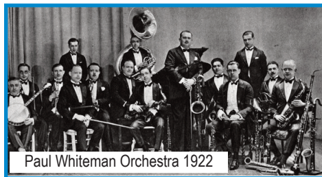
Paul Whiteman Orchestra 1922

The melody lines in compositions were the provenance of the trumpets (or cornets). Early on, around the turn of the 20th century, legendary New Orleans cornetist, Buddy Bolden, had brought that instrument to ascendancy. He was deemed a "king" of the instrument, with the title passed down next to Freddie Keppard and then Joe Oliver, with whom Louis Armstrong got his start. Some jazz bands had a violin that was part of this "front line." A violin in jazz may seem an oddity, but considering that New Orleans was the birthplace of jazz and the rhythms that influenced American popular music, this fact isn't a stretch. New Orleans was also a city of divergent cultural influences in which violins (or fiddles) were prominently used. W.C. Handy was especially fond of violins and had three of them in his orchestra. Embellishing the melody were the "second voices," clarinets, and as the music developed, saxophones, which provided melodic counterpoint and provided the greatest opportunity to improvise. Trombones were also responsible for the melody, but their function was primarily to add texture to it with slides, smears, trills and other similar embellishments.