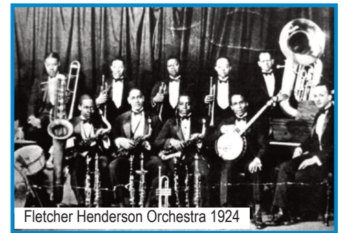
Fletcher Henderson Orchestra 1924

models) became the stringed instrument of choice in these bands, it was the banjo, known for providing a lot of volume, that was preferred. In the late 1800s, the banjo had become a very popular instrument upon which technical experimentation and advancement was